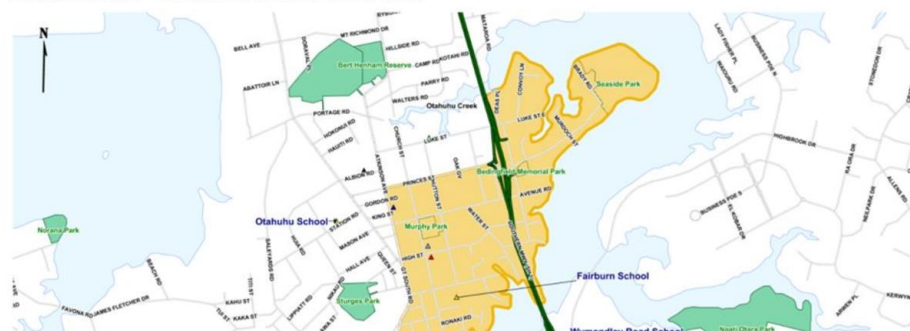
Fairburn School – Enrolment Scheme Home Zone

Starting at the intersection of Hospital Road and Mangere Road, travel north east along the centre of Mangere Road (148 and below, even numbers only included) to Great South Road. Travel north along the centre of Great South Road (611 - 689, 396 – 626 included) and continue north along the centre of Atkinson Avenue (24 – 82, even numbers only included). Travel west along the centre of Princess Street (23 and above, odd numbers only included) to the Southern Motorway - State Highway 1 (SH1). Travel north along SH1 to the Ōtāhuhu Creek and follow the coastline eastwards, around Seaside Park and south west, cross SH1 and the Tamaki Bridge, and continue to follow the coastline to Hospital Road. Travel northwest along the centre of Hospital Road (100 and below, even numbers only included), back to the starting point. (Proof of residence within the home zone will be required.)